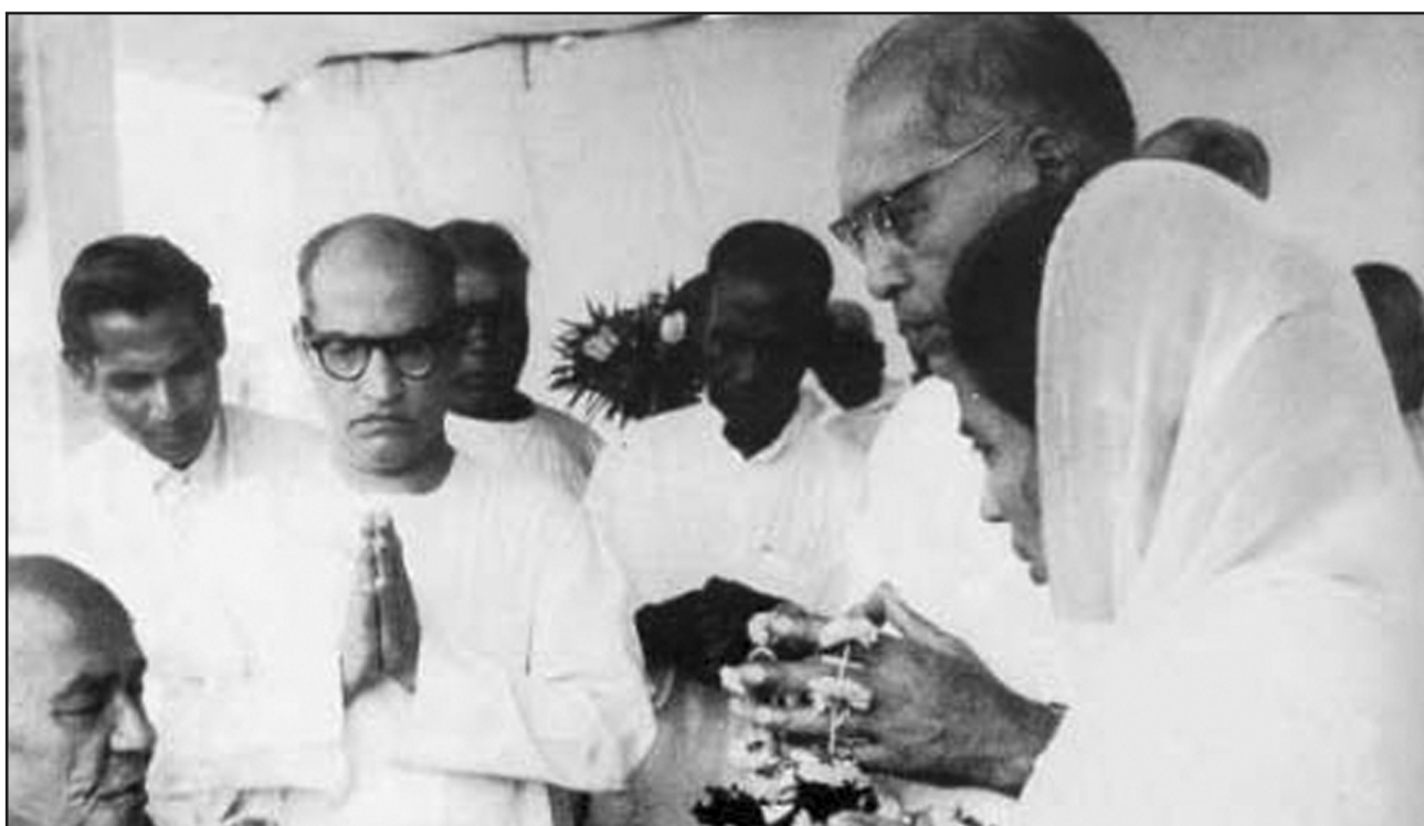
Dr. Ambedkar and Savita Ambedkar as they arrive for 'Dhamma Deeksha' ceremony at Nagpur 14 October 1956

world recognizes Buddhism an obstacle in the path of their loot & plunder. Buddhism is based on the scientific and rational teachings to follow for the betterment of the human beings. Dr. Ambedkar, an ardent fighter for the human rights for the millions of the down-trodden advised them to embrace Buddhism if to obtain self-respect and human dignity in a caste ridden society.